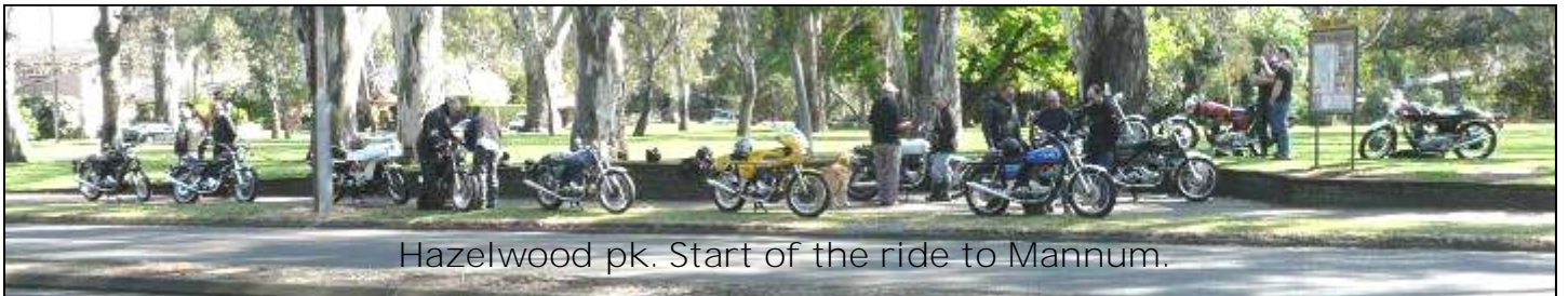
Hazelwood pk. Start of the ride to Mannum.