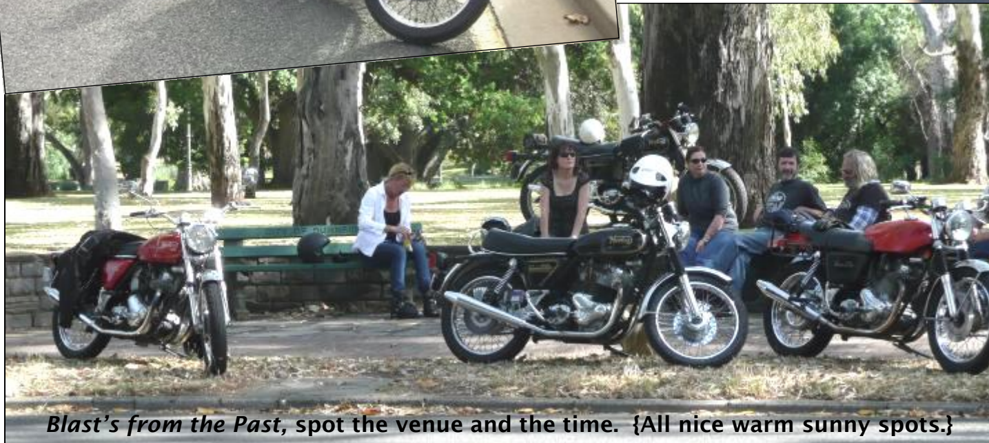
Blast's from the Past, spot the venue and the time. {All nice warm sunny spots.}