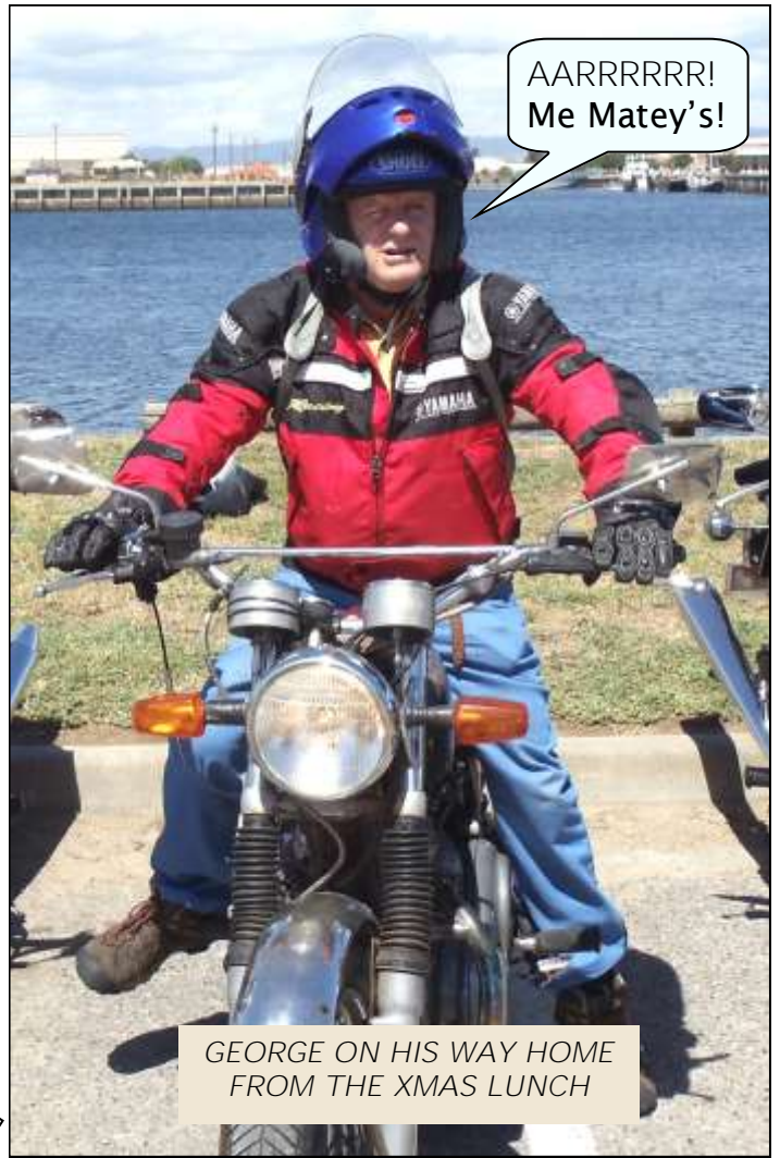
AARRRRRR! Me Matey's!