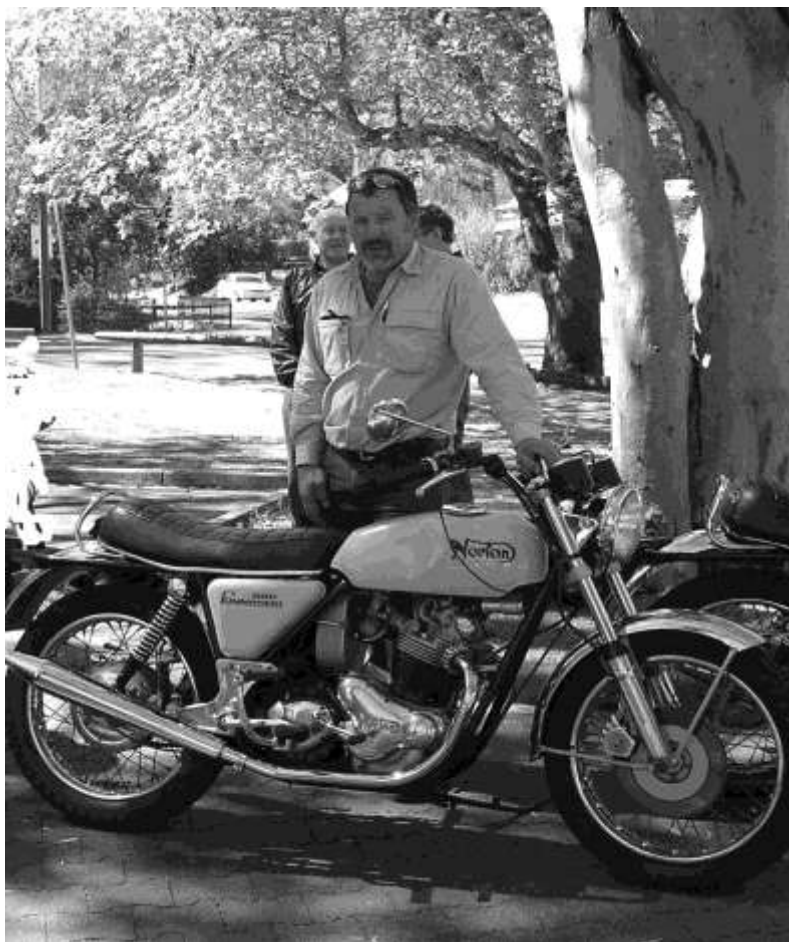
CHRISTMAS LUNCH Nov. 2010